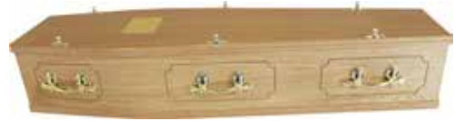
Rochester – Oak Veneer £520