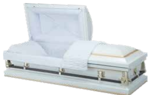
American-Style Caskets* American-style Caskets are available in wood or metal in a wide selection of designs From £1,470